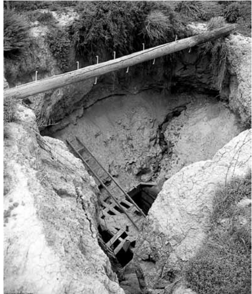
In 1954, the mineshaft on the western slope of Point Loma remained exposed.