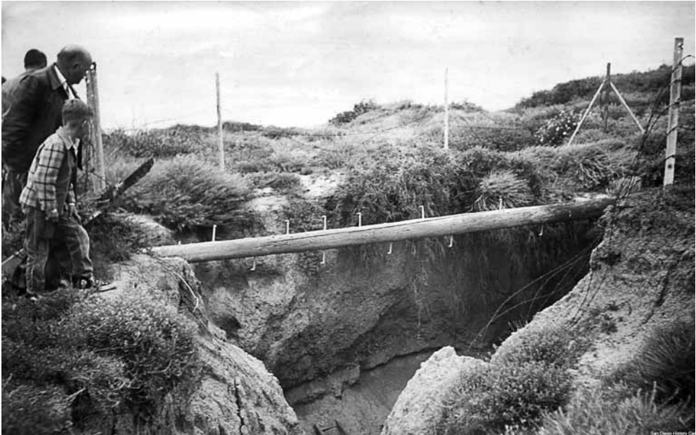
The mineshaft on Point Loma was "discovered" numerous times in the early twentieth century, 1954.