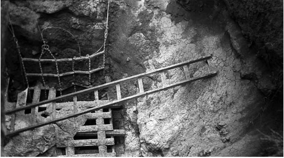
View into the old Mormon Coal Mine, Point Loma, 1954.

the “city of seers” (city officers) of San Diego: “We have labored all day today to bring them to terms and half of the knight (sic)...and found them rather hard in the mouth.” 32 Negotiations ultimately resulted in a fifteen-year lease of forty acres “to open and work a Coal mine.” 33