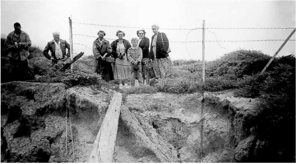
Visitors stand above at the old Mormon Coal Mine on Point Loma, 1954. ©SDHC, OP #12685-2.