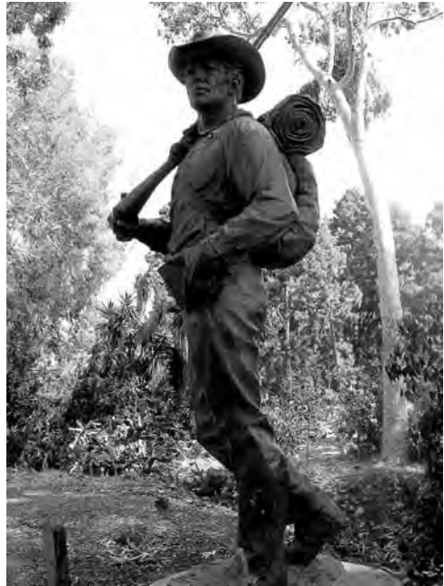
Statue of Mormon Battalion Soldier in Presidio Park.

Green led interested individuals to the site where he had first seen the coal. The mine that was opened to exploit that site was situated just north of where the Point Loma Wastewater Treatment Plant is now. 8