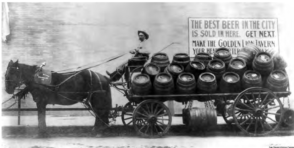
San Diego Brewing Co.’s horse-drawn wagon, 1900. An advertisement for the Golden Lion Tavern promises “The Best Beer in the City is Sold In Here.” ©SDHC #3608.

It took brewpubs, legalized in 1982, to effect changes in San Diegans’ taste for beer and they cultivated the market of consumers who were growing to dislike the readily available store-bought brews. Brewpubs provided the conduit for what was then considered a specialty beer to be sold to the general public. In