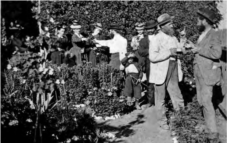
The City Brewery Saloon and Beer Gardens operated between 1868 and 1888 at the northwest corner of 5th and B Streets. The Saloon and Beer Gardens continued to serve customers until 1898. ©SDHC #10474-1.

Given its proximity to the border, San Diego stores filled their shelves with imported Mexican beers. San Diegans were satisfied with imported beer until 1985 when the price of imports skyrocketed as much as 58 percent. Some brands cost as much as six dollars a bottle, five dollars more than any of the national brewers' beer for the same volume. In 1989, Impact , a drinks industry newsletter, reported that “the market for imported beer is losing its sizzle,” increasing only four percent in 1988. Sonny Clark, a former brewer from Stone Brewing Co., commented on Mexico's dominance of the imported beer market during the 1980s: “Corona and Tecate dominated the shelves in San Diego because those were the only imported beers cheap enough for distributors to carry at the time. European imports were priced fairly high in those days. We are also close to the border so that had an effect.” He went on to say, “While San Diego in general