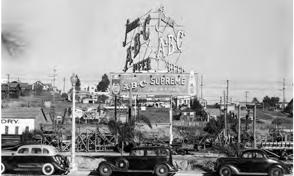
Aztec Brewing Co., founded in 1933, advertised its Famous ABC Beer (natural lager and supreme) as "Class in a Glass." ©SDHC Sensor #6-454.