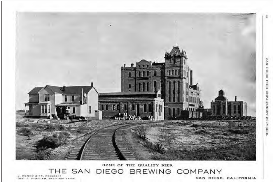
San Diego City Directory, 1897

was in a Corona craze, there were consumers who grew to dislike it.” 8