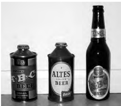
Altes Brewing Company out of Detroit purchased Aztec Brewing Company in 1948 and continued producing the "Famous ABC" brand of beer.

After the repeal of Prohibition, San Diego had only three breweries: Aztec Brewing Company, San Diego Brewing Company, and Balboa Brewing Company. Together, they produced 25 percent of all the beer produced in California. San Diego's population, meanwhile, had more than doubled, reaching nearly 290,000 in 1940. 21