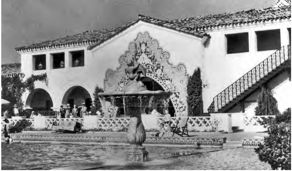
Agua Caliente Hotel, Tijuana, Mexico, c. 1935

more with the top three brewers—Anheuser-Busch, Coors, and Miller Brewing—accounting for 84 percent of the total domestic beer sales. 17