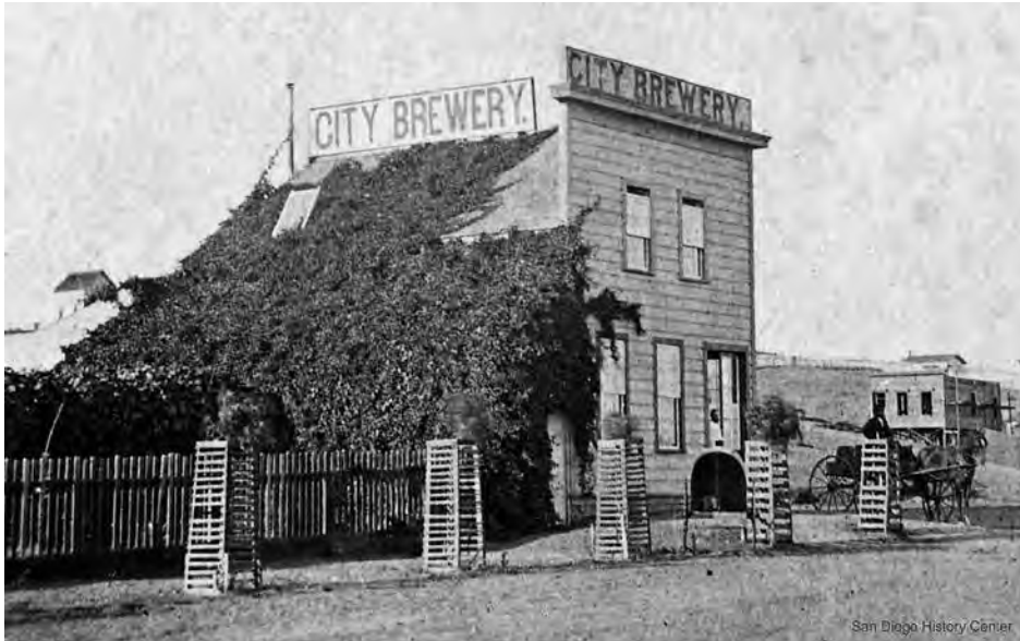
City Brewery located at 5th and B Streets in San Diego featured a beer garden in back, 1870. #10425.

the production of alcoholic beverages at home. In California, State Assemblyman Tom Bates authored what became known as the “Bates Bill” making possible the “manufacture of beer for personal or family use, and not for sale, by a person over the age of 21 years” (Cal. Code § 23356.2). The California legislature in 1982 permitted licensed beer manufacturers to “sell beer and wine, regardless of source, to consumers for consumption at a bona fide public eating place on the manufacturer’s premises and which are operated by and for the manufacturer” (Cal. Code § 23357), giving rise to the brewpub.