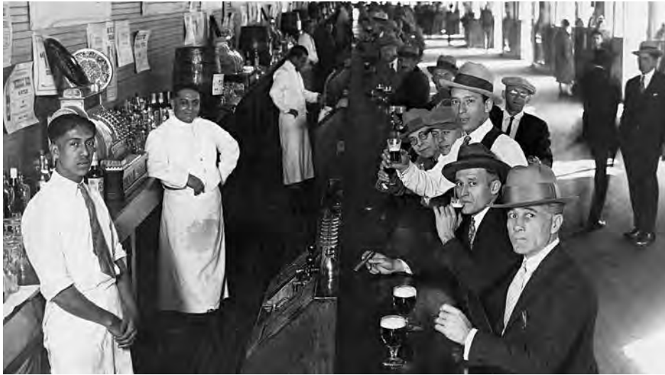
Called "The Longest Bar in the World" La Ballena served beer brewed by Cervecería Mexicali to its patrons, 1920. #UT 8175.

Almost as quickly as it arrived, the experiment of Prohibition failed in the United States and the amendment was repealed in 1933. Visitation to Tijuana decreased sharply and soon some cantinas closed. The breweries that had established themselves during Prohibition had lost much of their target market. Aztec Brewery, however, decided to move their operations north of the border and soon became San Diego's largest, and most beloved, brewery. 20