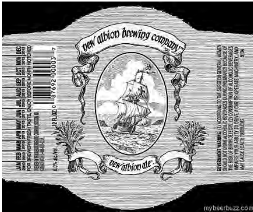
New Albion Ale beer label showing the ship of Sir Francis Drake near San Francisco Bay in 1579.

sell their brands almost exclusively. At the same time they used their massive resources to buy out local breweries across the nation. The national breweries' dominance in packaged beer, the increasing barrel taxes, grain rationing, the inability to adapt to stricter food and industrial laws, and the growing desire for imported beer led to the closure of all the local San Diego brewers by 1953. 22