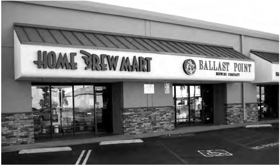
Exterior of Home Brew Mart/Ballast Point Brewing, 2013.