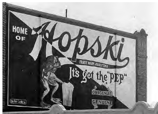
Mission Brewing Co., 1915. The brewery produced Old Mission Lager and Hopski, a non-alcoholic malt and hop soft drink. ©SDHC #4590-7.

Prohibition ended, but not without its consequences in the beer industry. In 1910, prior to Prohibition, there were some 1,500 breweries in the United States; after the repeal of prohibition the numbers grew slowly. Only 33 breweries had been re-established by 1940. Six of those breweries produced as much beer as the total of all breweries during the pre-Prohibition years. By 1980, the industry consolidated even