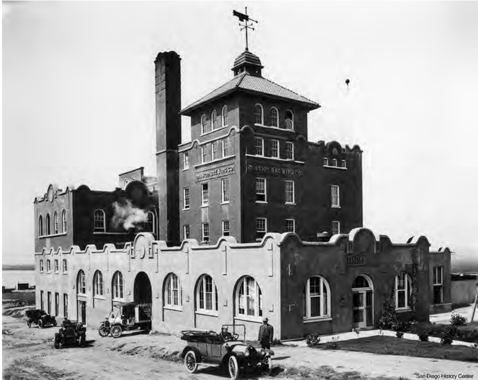
Mission Brewing Co., 1915. The brewery operated between 1913 and 1918 at 1751 Hancock Ave. In 1918-19, the vacant building served as an isolation hospital for victims of the flu epidemic. ©SDHC #4590-6.

San Diego, the first brewpub to open was Karl Strauss' Old Columbia Brewery & Grill in 1989. 9 For San Diegans, the brewpub's beer excited local palettes. Not as "hoppy" as the India Pale Ales (IPA) and Double IPAs of present day, the beers at Karl Strauss were inspired by German-style recipes from the brewpub's brew master, and Chris Cramer's relative, Karl Strauss, the former brew master for Pabst Brewing Company. 10 The rise of brewpubs, combined with growing dissatisfaction with imported beers, and the influence of home brewers began to educate San Diegans and shift their tastes from what they had known to what they did not yet know.