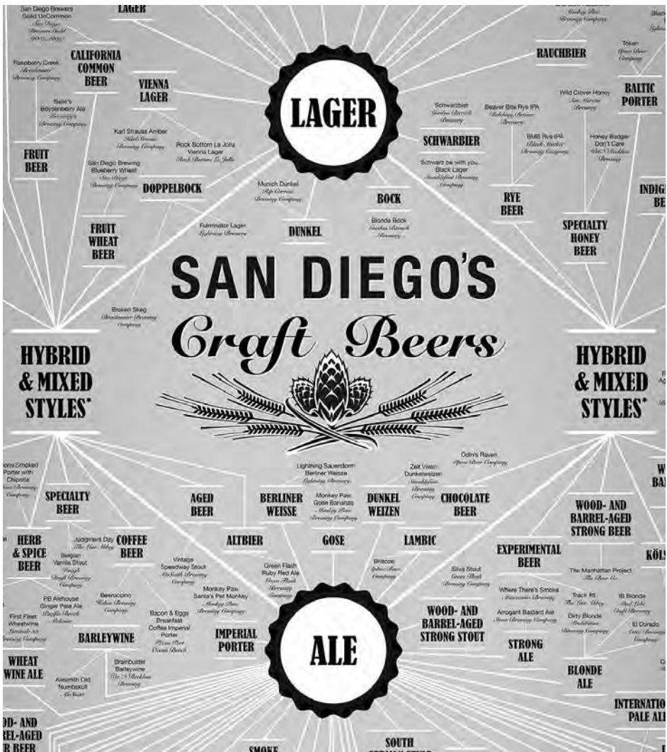
The many varieties of beer produced in San Diego County.

year-after-year, double-digit growth. In 2011, the craft beer industry grew 13 percent in volume and 15 percent in sales, following respective growth rates of 12 percent and 15 percent in 2010. 37 Of the current 65 breweries, all but 18 opened after 2006. 38 The market is so robust that many brewers find success brewing niche beers like Belgians or sours that add to the multitude of varieties that the county's brewers offer. While the future of the industry in San Diego County looks promising, there may ultimately be a time when the market becomes saturated and conglomeration or sell-offs occur but for now, there has certainly never been a better time or place to be a beer drinker in San Diego County.