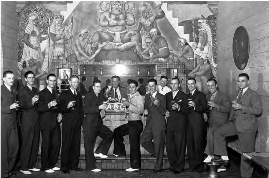
Aztec Brewing Co.'s softball team gathered in the colorful tap room, or Rathskeller, to celebrate their status as 1936 Champions of San Diego.