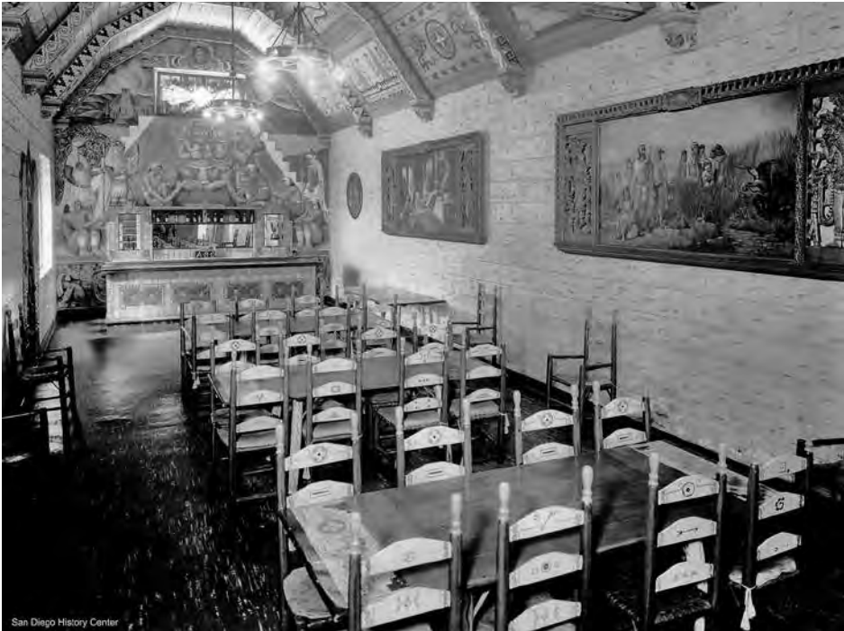
The Aztec Brewery's "Rathskeller." Aztec Brewery Interior, c. 1937. ©SDHC #7062.