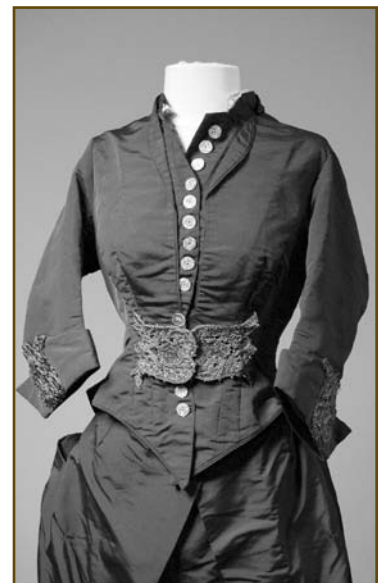
Nineteenth century decorative bodice with matching skirt