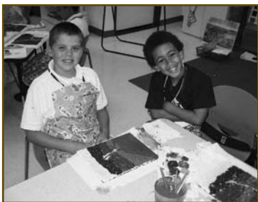
School in the Park students creating physical relief maps of San Diego County.

Rosa Parks and Hamilton Elementary School students have just finished their First Rotation of School in the Park . Over the past nine weeks, students have been learning map-reading skills as well as the diverse geography of San Diego County. The next Rotation, starting at the beginning of December, focuses on