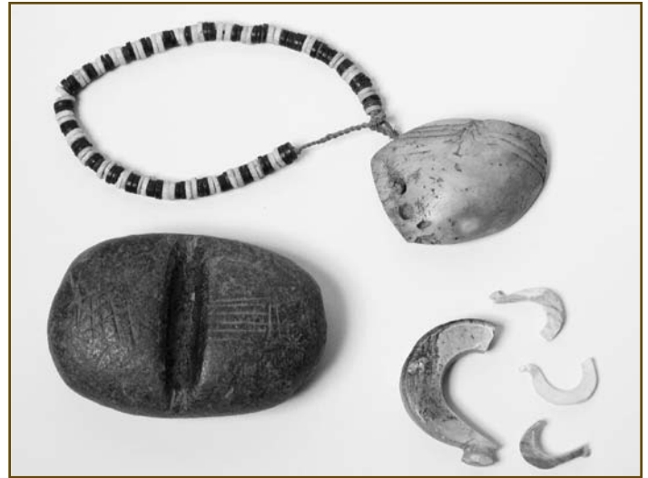
Native American artifacts (L-R): stone arrow straightener, shell necklace, shell fishing hooks