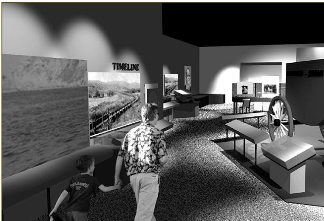
Concept illustration of Place of Promise: Phase 2