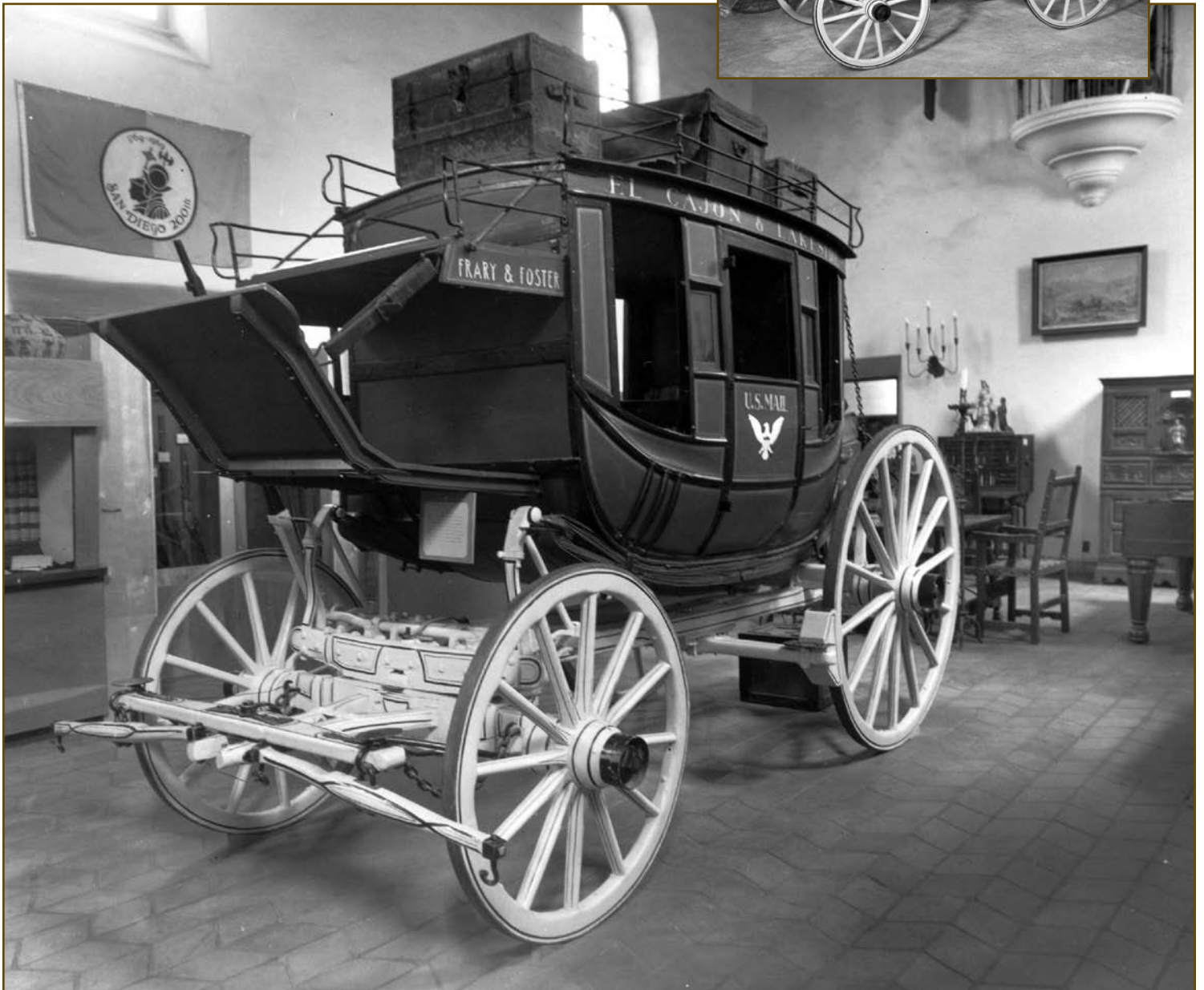
After the Concord Stagecoach was on display at the Serra Museum, it spent time in storage (inset). It will now serve as the featured artifact in Place of Promise: Phase 2.