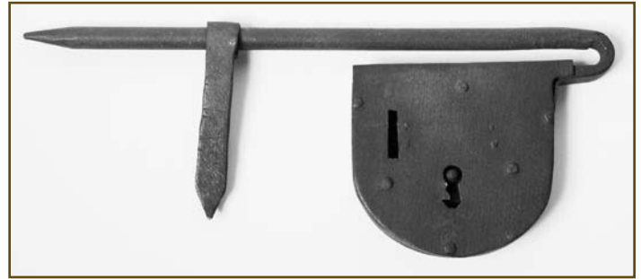
Eighteenth century iron lock from Mission San Juan Capistrano

Be sure to visit our website www.sandiegohistory.org for updates on the progress of the exhibition.