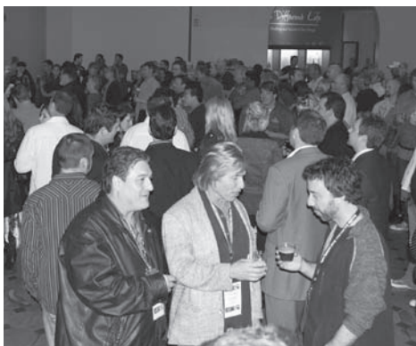
Left: Taste of San Diego Micro Brews at San Diego History Center. Right: History/Social Science students show off their projects.