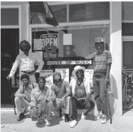
As a result of the NEA grant, a significant portion of the Baynard Collection will be accessible to the public for the first time.