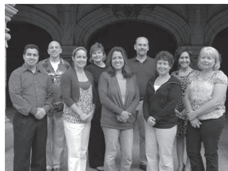
The Teacher Advisory Board will work to support and strengthen SDHC’s K-12 programs.