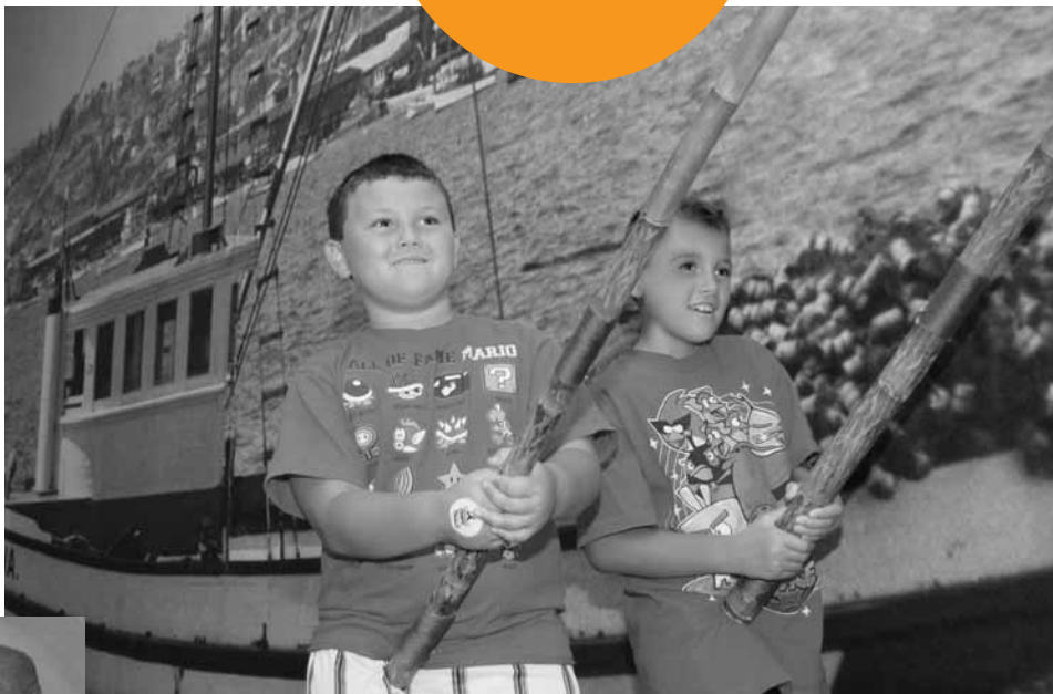
Above: Two aspiring young fishermen test their strength on the interactive pole activity in the TUNA! exhibition.