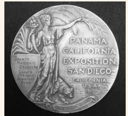
Above: Gold Medal from the 1915 Panama-California Exposition.

Here are two of the many items we have in our Object Collection from the 1915 Panama-California Exposition.