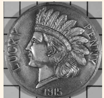
Above: Souvenir "Lucky Penny."

"Grants Hygienic Crackers" were produced by the Hygienic Health Food Company of Oakland, which claimed they relieved "constipation, indigestion, dyspepsia, and sour stomach." There were attempts to prove misrepresentation of the beneficial effects of the biscuits, but nothing came of it, and their adverts continued to print glowing accolades from customers.