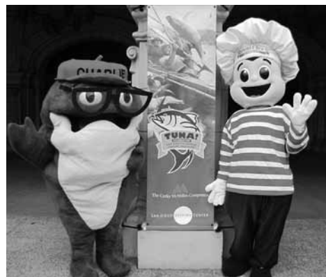
Above: Charlie the Tuna and Horatio the Bumble Bee join the festivities for the TUNA! exhibition opening.