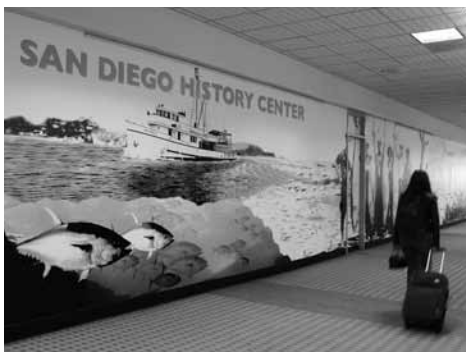
Left: In conjunction with the TUNA! exhibition at the History Center, a large display is in Terminal 2 in collaboration with the San Diego International Airport Art Program.