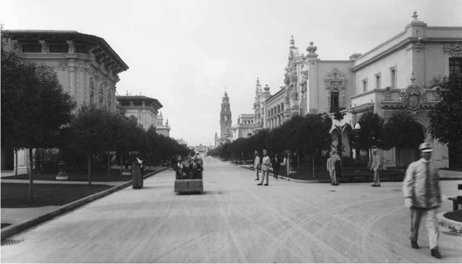
A view on the Prado from the 1915 Panama-California Exposition, from the SDHC Photograph Collection.