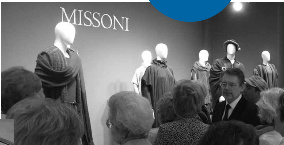
Above: The Costume Council visits the exhibition Il Teatro Alla Moda in Beverly Hills.