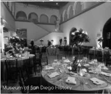
Museum of San Diego History