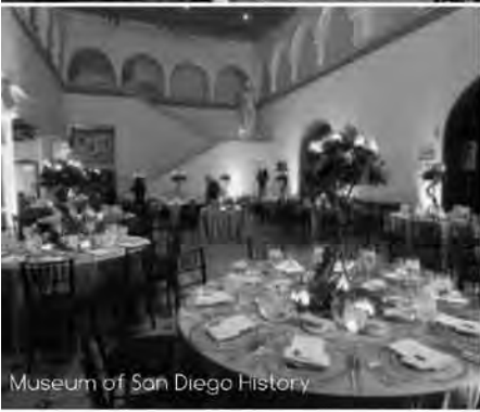
Museum of San Diego History