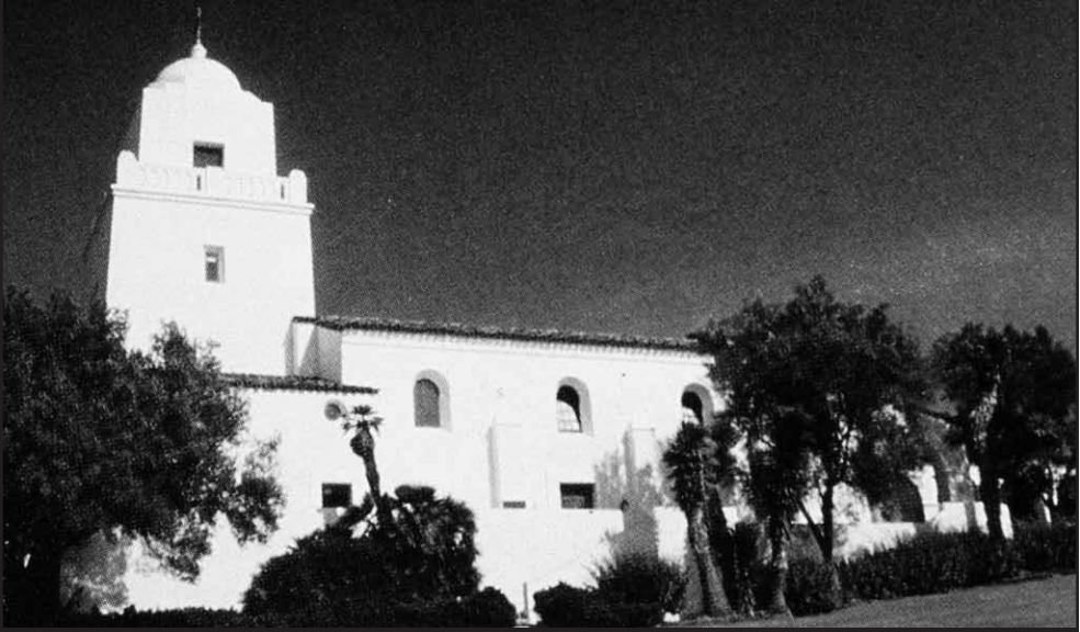
Museum built in 1929 as headquarters for the San Diego Historical Society.

Honors the first site of Mission San Diego de Alcalá and the Presidio of San Diego National Historic Landmark State Historic Landmark