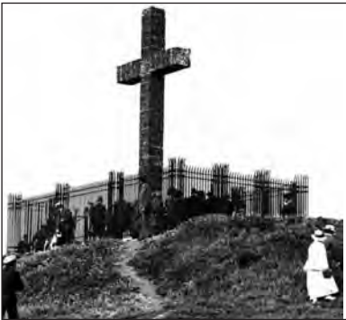
Cross first erected by the Order of Panama in 1913 from Presidio tiles.

Padre Junipero Serra was born in Petra de Mallorca, Spain in 1713. He arrived in New Spain (Mexico) in 1749. After working in the missions of New Spain for twenty years, he led the expeditions to Alta California in 1769 and founded the first nine of the twenty-one California missions.