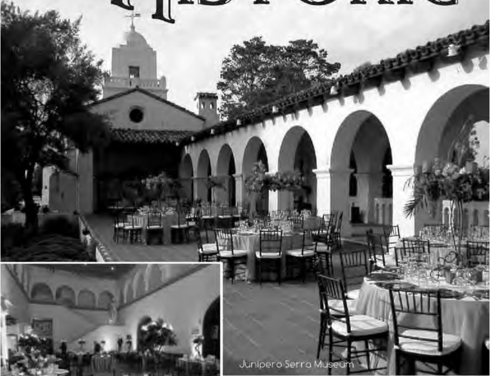
Junipero Serra Museum