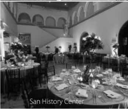
San Diego History Center