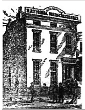
Louisville National Medical College, circa 1889.