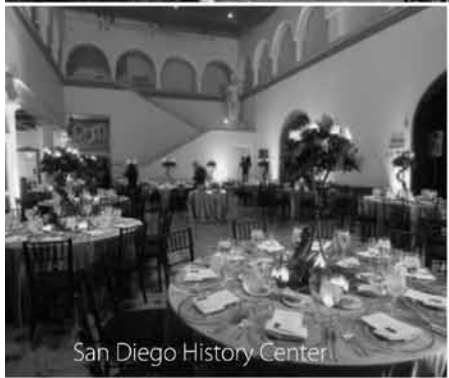
San Diego History Center